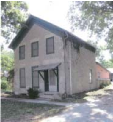
215 S Dacotah. East and north elevations, looking SW. 01/2013.