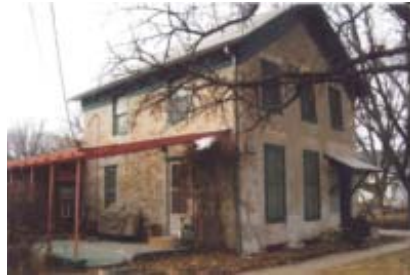
215 S Dacotah. South and east elevations, looking NW. 01/2013.