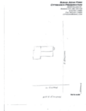
215 S. Dacotah, site plan, Ford, 08/02/2011.