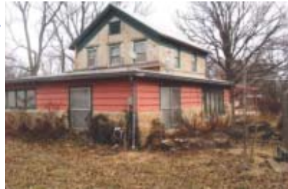
215 S Dacotah. West and south elevations, looking NE. 01/2013.