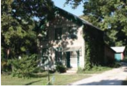
215 S. Dacotah, southwest view, Ford, 08/02/2011.