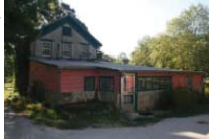
215 S. Dacotah, southeast view, Ford, 08/02/2011.