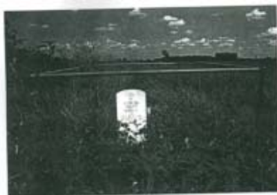
Samuel Hunt Grave. View East. 07/1991.