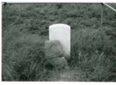
Samuel Hunt Grave. View from E. Old stone in foreground leaning against back of new stone. 07/27/71.