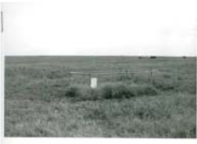
Samuel Hunt Grave. View from SW. 07/27/71.