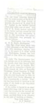
Samuel Hunt Grave. Burlingame Enterprise Chronicle. 06/18/25.