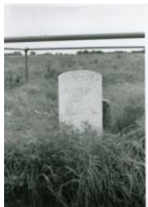
Samuel Hunt Grave. View from W. 07/27/71.